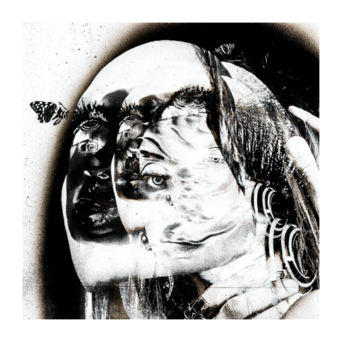
1. If You Know

For more information on KEYAH/BLU, please contact: \underline{dan@they\text{-}do.com}